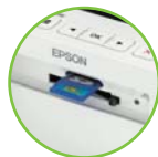
Step 1 Insert memory card