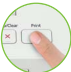
Step 3 Print

You may also choose to connect directly to your digital camera using PictBridge / USB Direct, or simply go wireless via Bluetooth ^ .