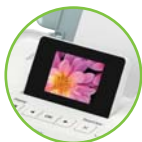
Step 2 Select Photos/ Settings